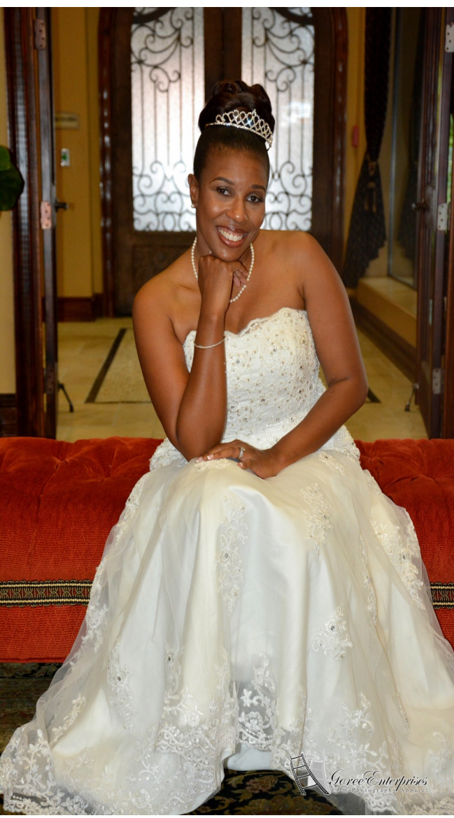
Photography & Videography Service